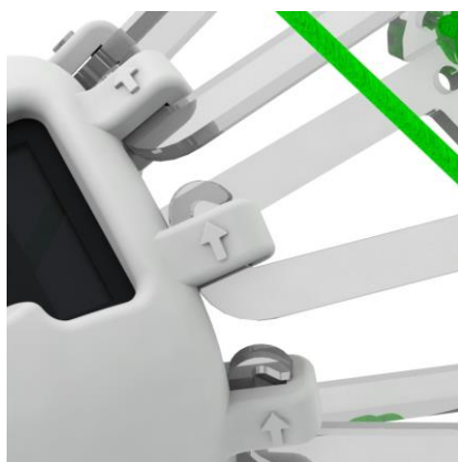
wings position in apertures